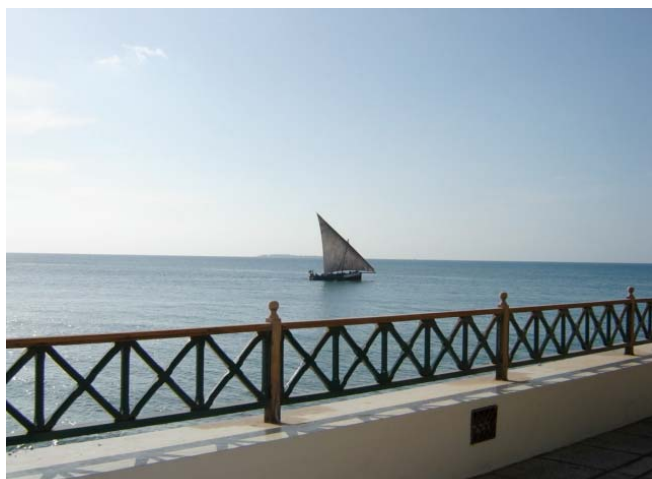
Terrawatu/Global Exchange Tanzanian Reality Tours now include a Swahili Coast segment to learn about Islam in Africa and conservation of marine resources.