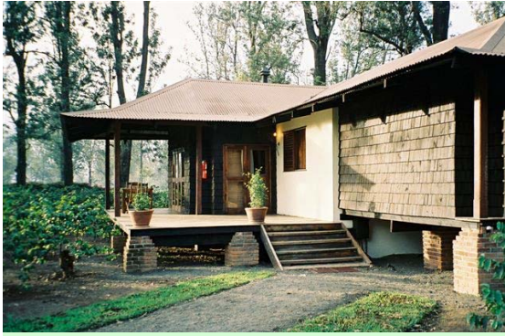
Room/small house at Arusha Coffee Lodge, just outside Arusha town.

After arriving at Kilimanjaro Airport and riding about an hour to my first lodging Tanya and Sululu went to the bar while I went to my "room", which in fact was my own small house. I had been greeted warmly and given a glass of delicious tomato juice (I would later eat tomatoes in Tanzania to rival even those in Italy). I was then guided along a gravel path to my lovely bungalow in the middle of a coffee plantation. I wouldn't see until morning how beautiful the setting was, but the house was delightful. I changed my shirt, and rushed back to the bar for my first Tanzanian beer and a planning chat with Tanya and Sululu.