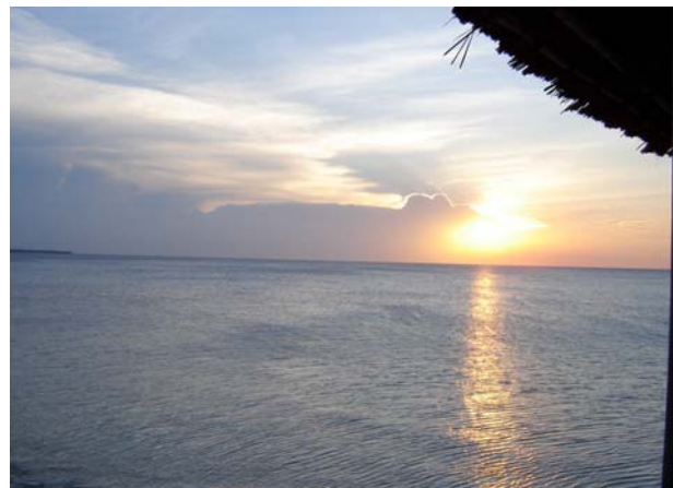
Sunset on the Indian Ocean, Zanzibar, Tanzania.

I was traveling alone on this trip, which meant my schedule didn't have to accommodate different philosophies of tourism, like my wife's. Since I didn't know I was even going to go to Zanzibar ahead of time, I hadn't researched the sites, so I enjoyed my own favorite way of sightseeing: haphazard wandering, meeting locals, and on that particular day, a three hour lunch on curried barracuda and cold Killis at the beach, toes in sand. I couldn't take my eyes off the Indian Ocean, and there was plenty of activity on the beach to observe, so I sat and shared my lunch with a stray cat.