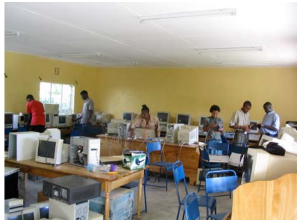
Ilkiding'a staff sorting technology at one of Terrawatu's ICT Centers "in the bush".