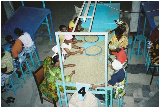
Coffee processing in Moshi, Tanzania.

Coffee central for north Tanzania is Moshi. Here is where the auction board is, many merchants, and processing facilities. Sululu knew of a large facility that would likely give me a tour, a first for me. I've spent exactly 7.9% of my awake life underground in wine cellars across Europe, but this would be the first time I'd see how coffee is processed on a large scale. Immediately the difference is one of hygiene and noise. It's dusty and loud! But the more important differences are of simple scale. In a large co-op, coffee is processed using very large, very expensive machines which grade, mill, and sort the coffee according to its quality. Then samples are sent out for auction buyers and other importers.