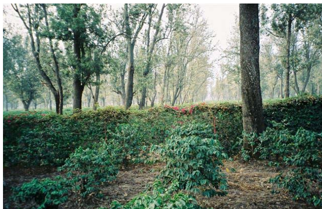
Coffee plants growing in Arusha region of Tanzania.

The necessity of going to Africa became thoroughly lodged in my every waking thought during the aftermath of Hurricane Wilma. I relaxed in the glorious post-hurricane weather, with no electricity or water, cooking on my camp stove, reading books and drinking wine. There was ample time for new revelations about many subjects to congeal and harden into a sharp, decisive point: It's time to experience Africa. Not to read about it, philosophize or patronize. It was time for me to move beyond spoon fed, politically correct assumptions about the continent and get the dirt under my fingernails. I had been dreaming for months the best way to get myself into the coffee business.