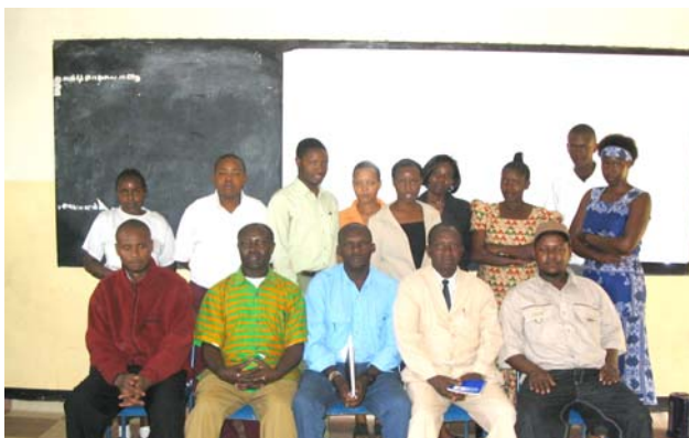
Tanzanian Team Partners from Ilkiding'a and Siwandeti Villages.

The twenty-two member team from Global Technology Academy (GTA) in Seattle, Washington, USA will be arriving in Arusha on 2 April with newly refurbished computers, keyboards, and other peripherals in their check-in luggage.