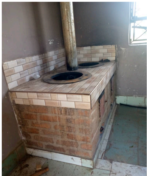
New kitchen at Kibowa Orphanage.

Focal Areas: Education, Environment, Health, Sustainable Agriculture